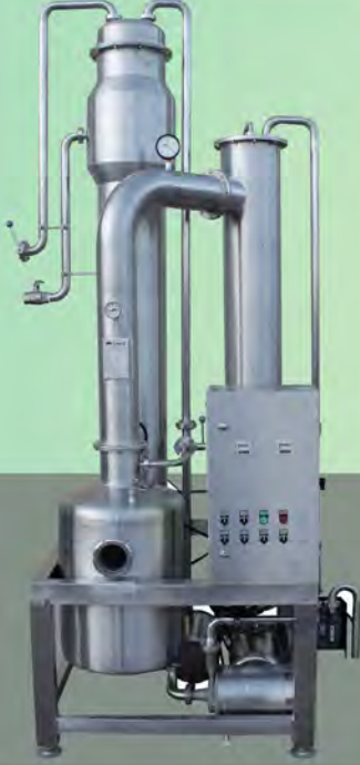
EVAPORATOR (250 lt/h water evaporation capacity)